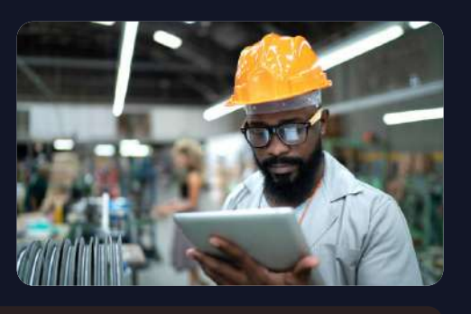
Business Engagement 166 businesses supported